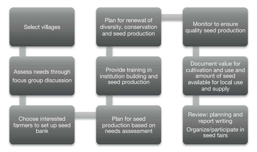
Figure 19.1 Steps in setting up and maintaining a community seed bank